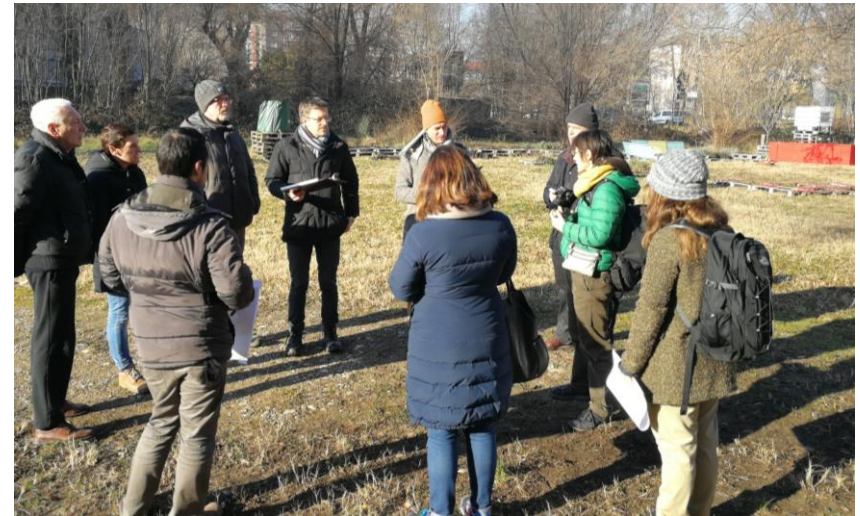
Milan/ Citizens of Gambellino

Bottom-up projects in Milan will promote green roofs and walls, green infrastructures and noise barriers, and locals will decide how to make space for urban gardening in LORENTEGGIO-GAMBELLINO DISTRICT and around the TIBALDI train stop.