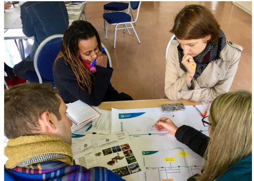
London / Citizens of Thamesmead

In London, new planting, raingardens and swales will green walking routes to improve connections and encourage people to be more active. A new smart green-blue roof and lakeside improvements will help to transform SOUTH THAMESMEAD.