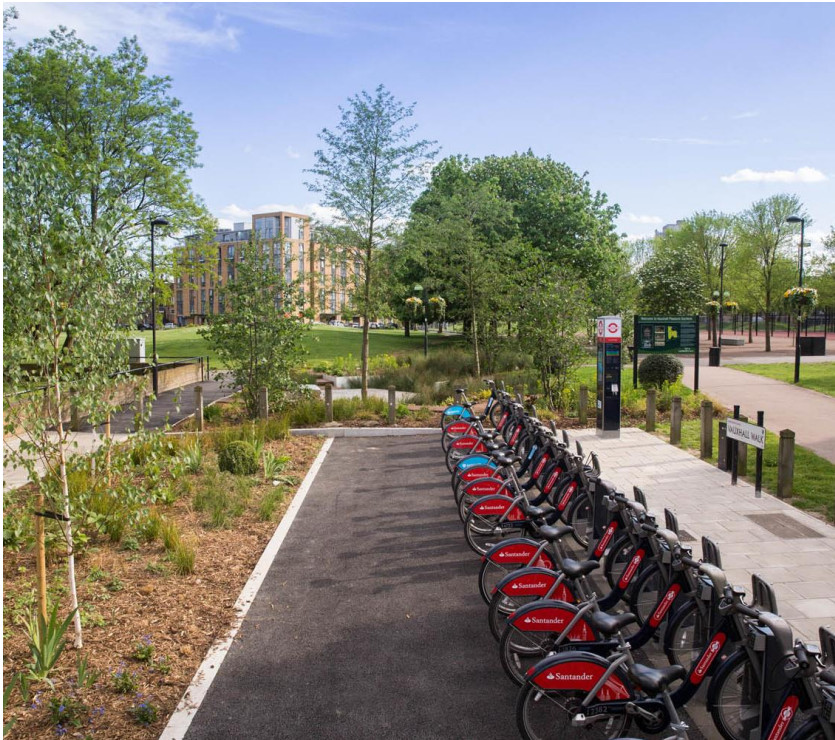
Vauxhall Rain Garden